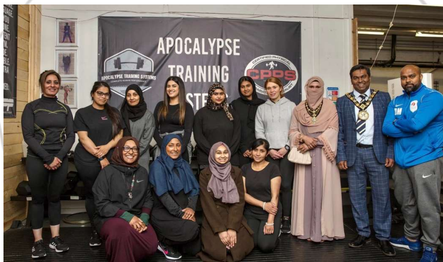
Basa Active Women

The Basa Runners group continue to grow and the participants are involved in many organised races for both personal gains and raising awareness and funds for many different charities. Here we have runners from Basa involved in the Race at Heaton Park for Movember.