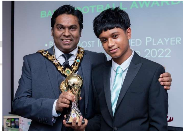
BASA Most Improved Player Of The Year Award 2022