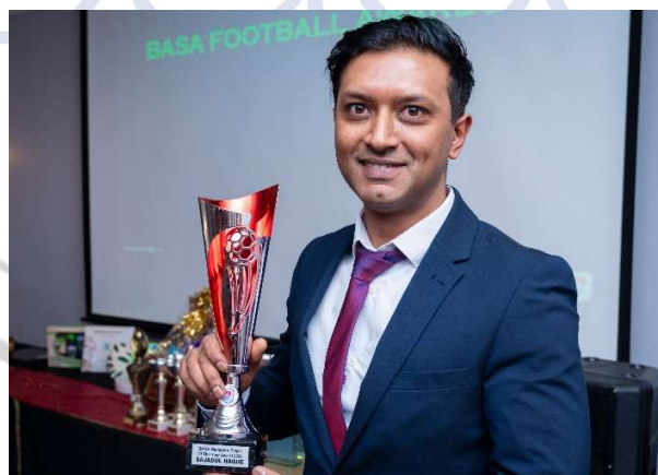
BASA Managers Player Of The Year Award 2022