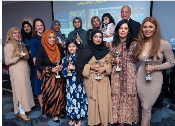
Basa Active Women Award 2022