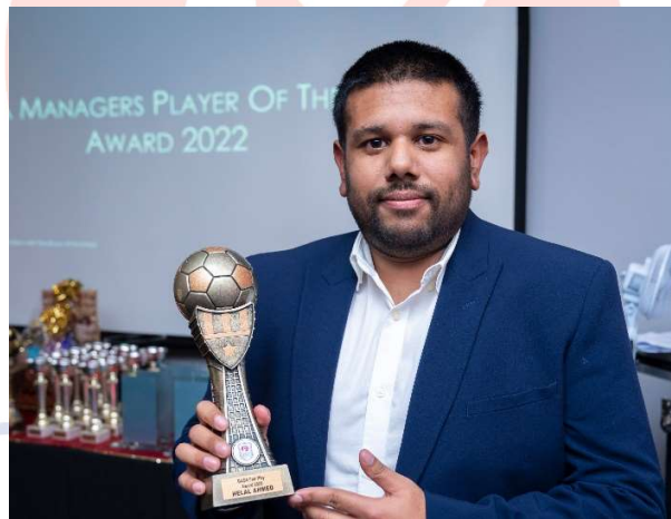
Basa Fair Play Award 2022