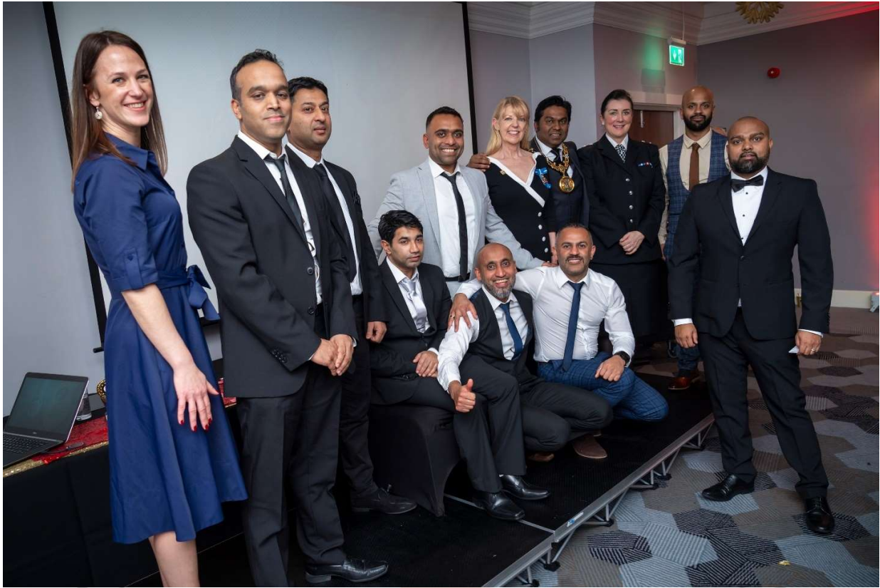
The Basa Management Team with Dignitary Guests at The Basa Awards 2022.

BASA – Who are they and what do they do?